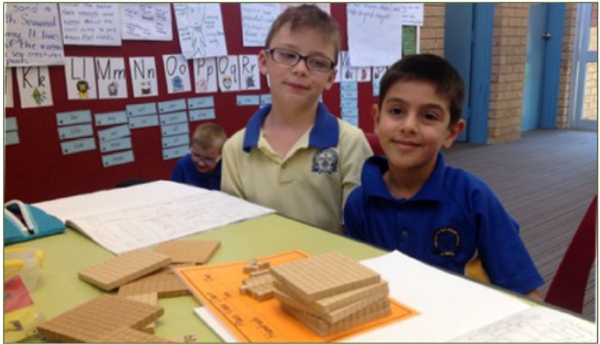
Year 2 have been counting, ordering and reading two and three digit numbers.