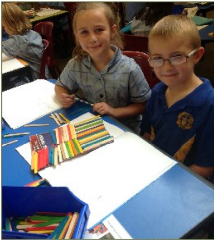
In Maths, we have been learning to find the area of different things.