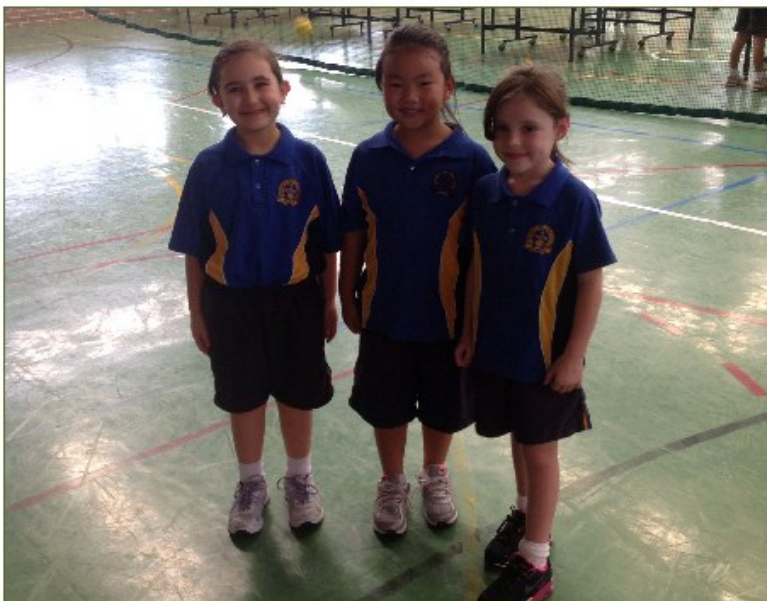
We love going to Don Bosco for sport.